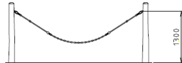
Fig. G3. Elevation Not to scale