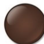
Brown Rubber Coated