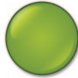
SMP lime green