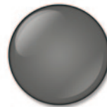
silver gloss pearl