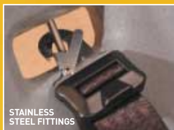
STAINLESS STEEL FITTINGS